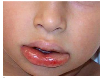
Swelling of mouth

Even where mild symptoms are present, the student should be watched carefully. They may be heralding the start of a more serious reaction.